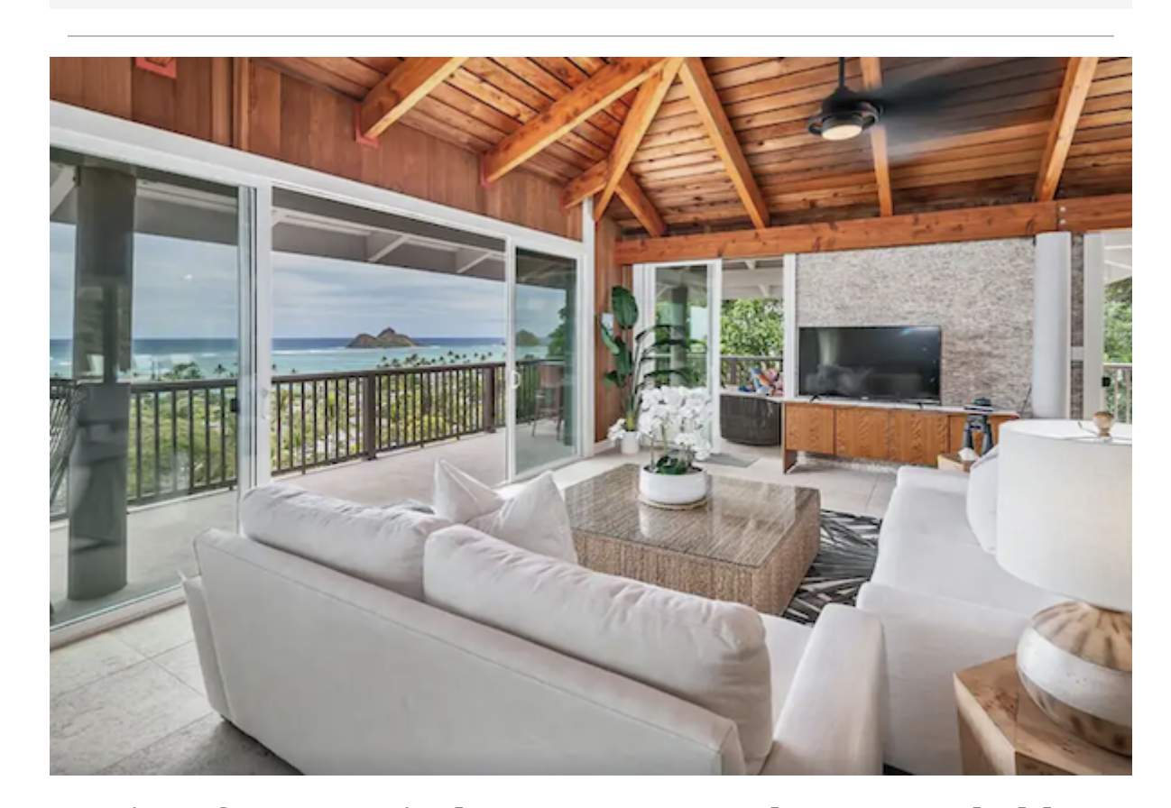
Time for a Tropical Getaway? Try These 4 Bookable Vacation Rentals in Hawaii