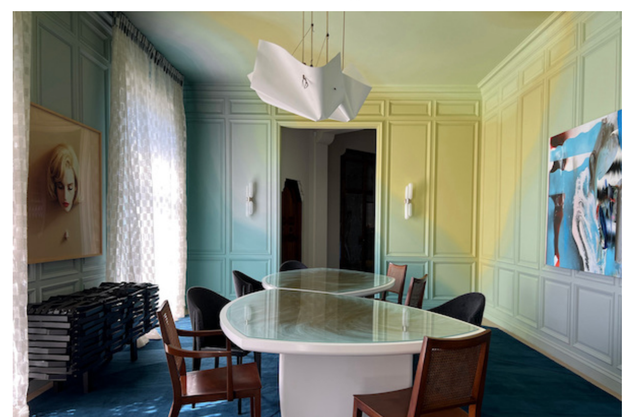
Want Free Tickets to the San Francisco Decorator Showcase?