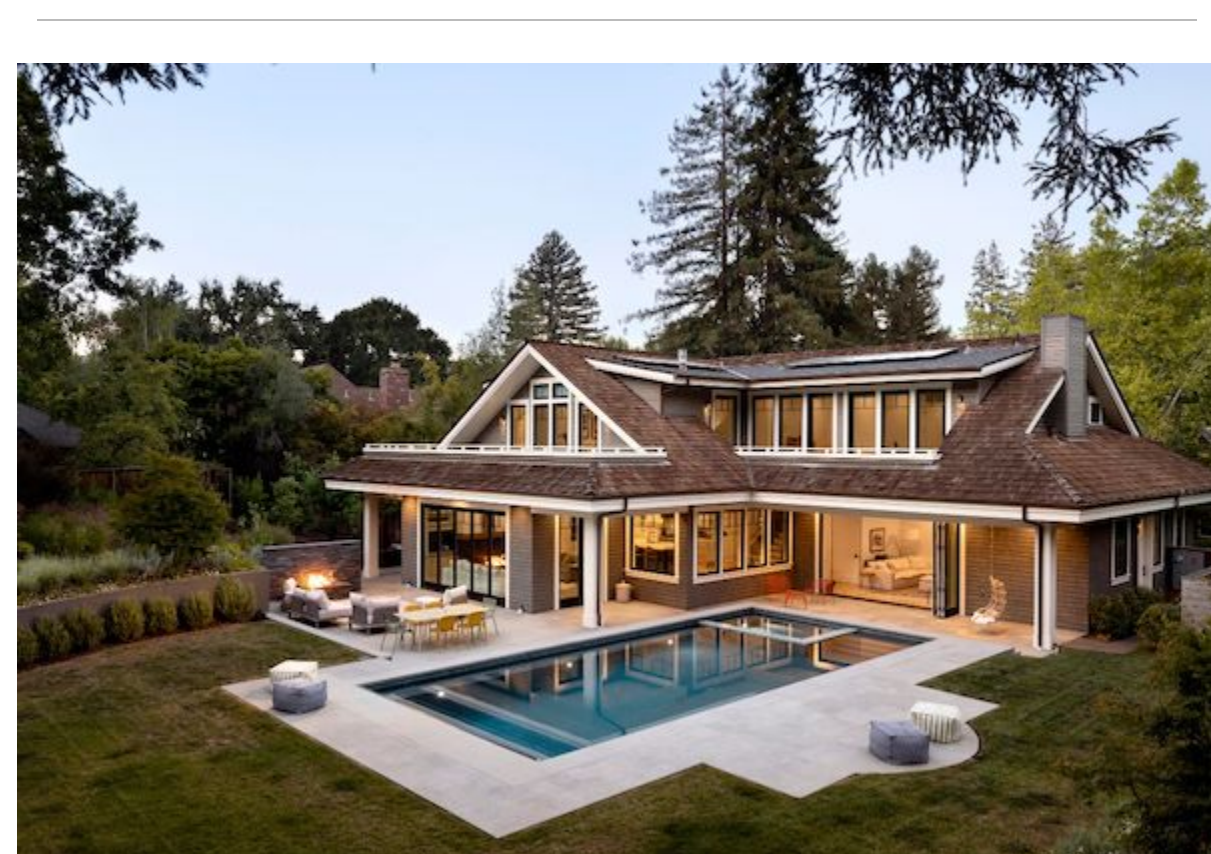
An Idyllic Ross Home Made for Indoor/Outdoor Living

625 EL CAMINO DEL MAR, SAN FRANCISCO APRIL 29 - MAY 29, 2023