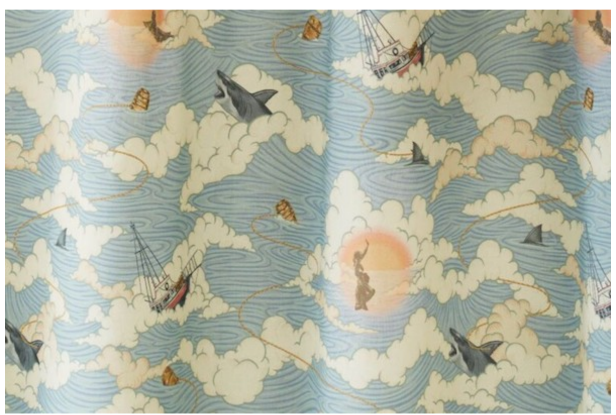
Flair, Refinement, and all Things Mixed: Beautiful Bathroom Essentials