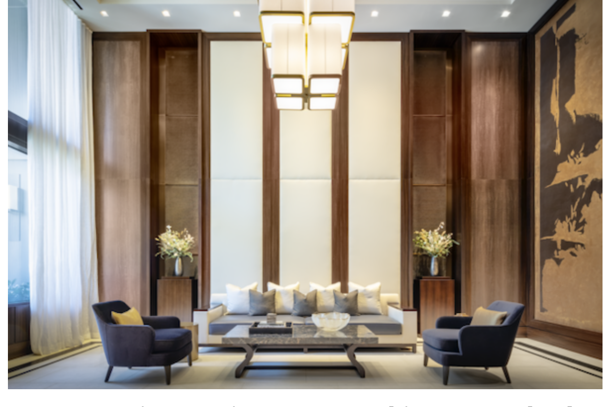
San Francisco's Union House Combines New School Luxury with Classic Design